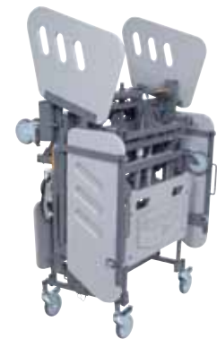
Tri-Flex II Compacted View

Impulse Bed Drive System is Safer for Staff, Saves Time and Simplifies Emergency Transport.